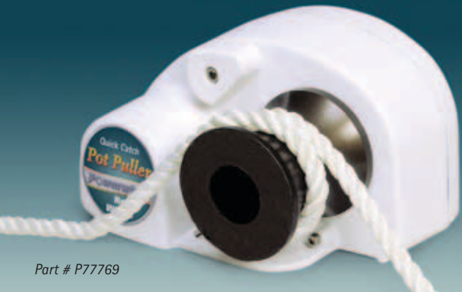
Part # P77769