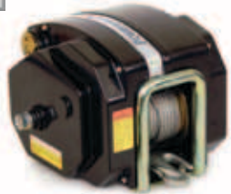
Part # P77915