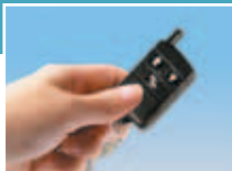
Wireless remote control