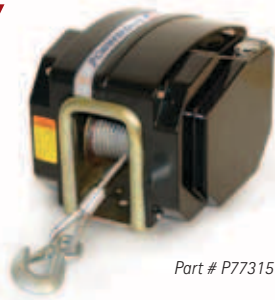
Part # P77315