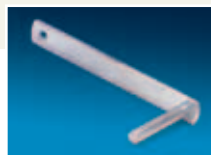
Emergency crank stores in winch casing