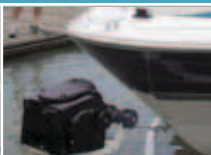
Effortless electric POWER trailer loading