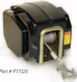
Part # P77325