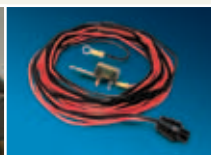
60 amp standard wiring harness included