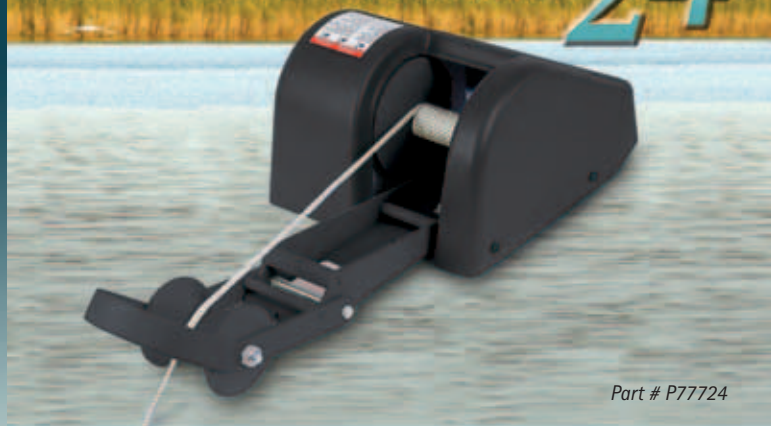
Part # P77724