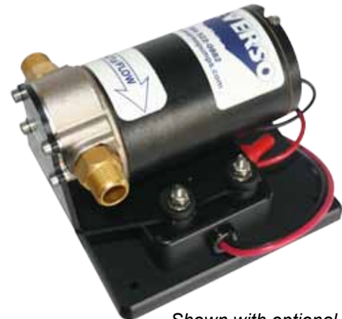
Shown with optional switch