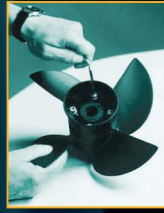
3. Tighten bolts w/ allen wrench.