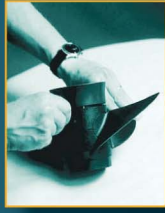
3. Grasp two opposite blades and turn to the right pitch on the scale.