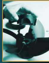
2. Separate the propeller to release blades. Change blades & reassemble unit.