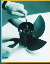
1. Release the bolts.