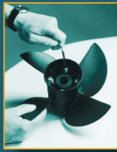
1. Release the bolts.