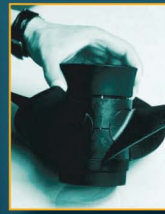
2. Lift the ring approx. 2mm.