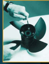
4. Tighten bolts w/ allen wrench.

Propulse blades can be set to five or seven different positions depending on the model. The pitch at the mid position is stamped on the blade foot. Moving one position changes the pitch 1" and the max revolution +/- 200 rpm. The right pitch achieves the rpm recommended by the engine manufacturer.