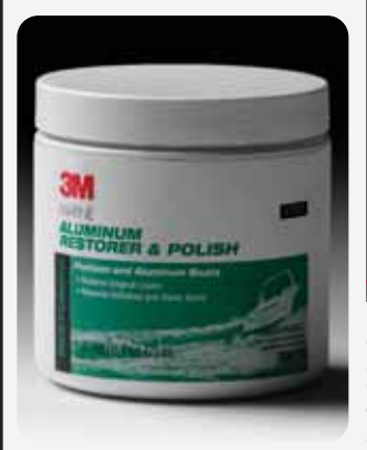
Marine Aluminum Restorer and Polish to restore bare

Mariners who own aluminum boats can use 3M^{\mbox{\tiny TM}}