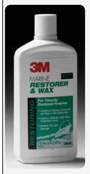
heavy oxidation, chalking, fading, minor scratches, rust and exhaust stains.

3M<sup>™</sup> Marine Restorer and Wax is designed to remove