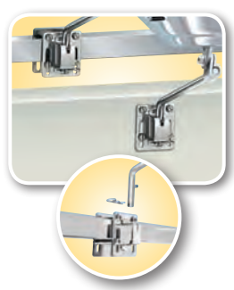
Side (Bulkhead) or Square/Flat Rail Mount A10-240