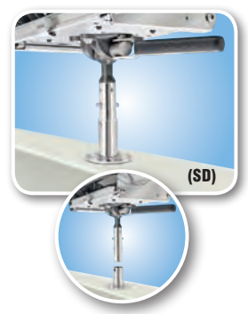
"Single" Locking Surface Deck Socket with "LeveLock" Mount T10-322