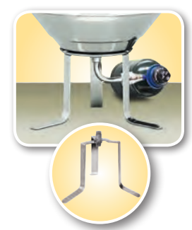
Shore Stand/Table Top Legs