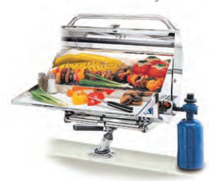
"Newport" Gas Grill A10-918L rea: 162 sq. in, (1045 sq. cn

• Piezo Igniters • Thermometers • Fully Double Lined Safety Shells • Folding Legs • 100% Mirror Polished 18-9 Stainless Steel