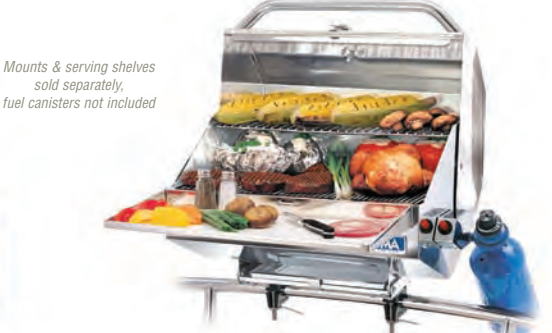
"Catalina" Gas Grill A10-1218L

Grill area: 162 sq. in. (1045 sq. cm.) 9 x 18 in. (23 x 46 cm)