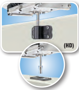
Socket Type Fish-Rod Holder Mounts T10-360 Fits Tempress Fish-On® & Roberts Rod Holder Sockets Rod holder sockets not included.