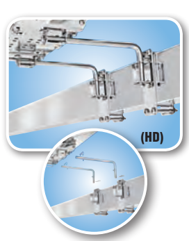
Extended "Dual" Side, Bulkhead or Square/Flat Rail Mount Fits up to 4-1/8" (105 mm) sq. rail T10-641

T10-780 Standard Rails 7/8" or 1" (22 mm or 25.5 mm) T10-785 Oversize Rails 1-1/8" or 1-1/4" (28.5 mm or 32 mm) T10-790 Large Rails 1-1/2" (38 mm)