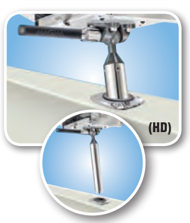
"LeveLock" All-Angle Fish-Rod Holder Mount T10-355