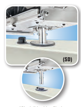
"Single" Locking Flush Deck Socket Mount T10-326