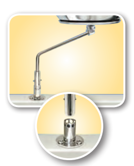
Surface Deck Socket Mount A10-121