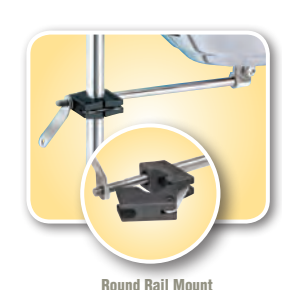
A10-080 Standard Rails 7/8" or 1" (22 mm or 25.5 mm) A10-085 Oversize Rails 1-1/8" or 1-1/4" (28.5 mm or 32 mm)