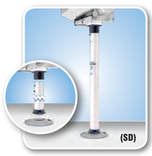
28 in. (71 cm) Double Locking Stowable Pedestal Mount T10-185