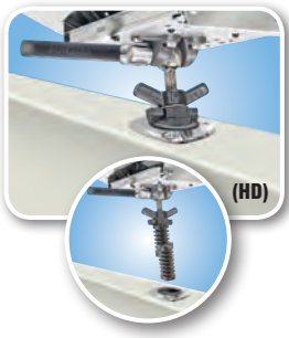
"Pow'rGrip™ LeveLock"® Double Locking Fish Rod Holder Mount T10-375