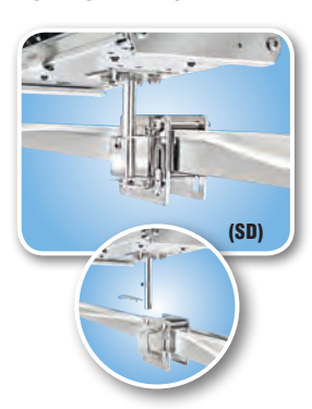
"Single" Side, Bulkhead or Square/Flat Rail Mount T10-340

T10-380 Standard Rails 7/8" or 1" (22 mm or 25.5 mm) T10-385 Oversize Rails 1-1/8" or 1-1/4" (28.5 mm or 32 mm) T10-390 Large Rails 1-1/2" (38 mm)