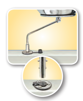
Flush Deck Socket Mount A10-126