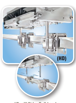
"Dual" Side, Bulkhead or Square/Flat Rail Mount T10-540

1-1/8" or 1-1/4" (28.5 mm or 32 mm) T10-590 Large Rails 1-1/2" (38 mm)