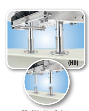
"Dual" Locking Surface Deck Socket Mount T10-521