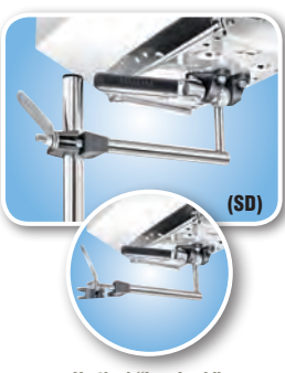
Vertical "LeveLock"® Round Rail Mount

T10-780 Standard Rails 7/8" or 1" (22 mm or 25.5 mm) T10-785 Oversize Rails 1-1/8" or 1-1/4" (28.5 mm or 32 mm) T10-790 Large Rails 1-1/2" (38 mm)