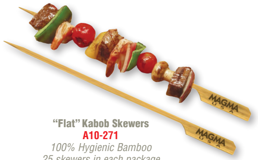
25 skewers in each package Food won't roll when turned