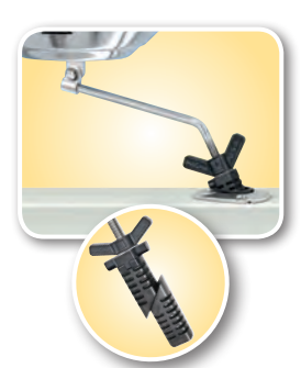
POW'R GRIP™ Fish Rod Holder Mount A10-175