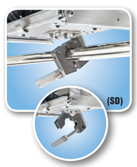
"Single" Horizontal Round Rail Mount

T10-380 Standard Rails 7/8" or 1" (22 mm or 25.5 mm) T10-385 Oversize Rails 1-1/8" or 1-1/4" (28.5 mm or 32 mm) T10-390 Large Rails 1-1/2" (38 mm)