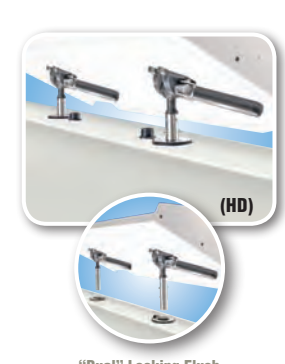
"Dual" Locking Flush Deck Socket with "LeveLock" Mount T10-527