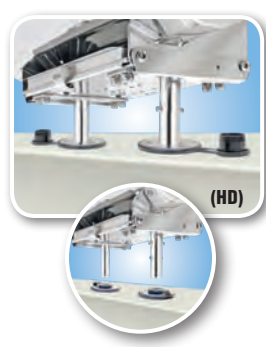
"Dual" Locking Flush Deck Socket Mount T10-526