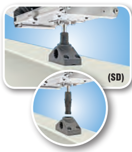
Socket Type Fish-Rod Holder Mounts T10-365 Fits Scotty*/Striker Grip Rod Holder Sockets Rod holder sockets not included.