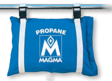
Propane/Butane Canister Storage Locker/Tote Bag

130 pages of recipes and tips for portable grilling