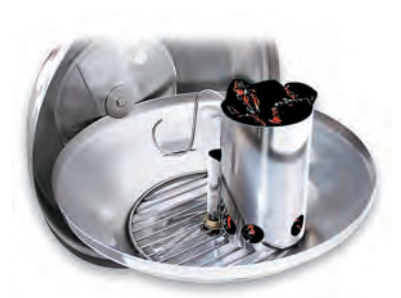
"Easy Light"™ Charcoal Starter A10-150