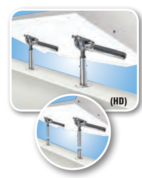
"Dual" Locking Surface Deck Socket with "LeveLock"® Mount T10-522