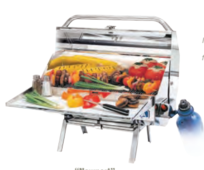
"Newport" Infrared Gas Grill A10-918LS a: 162 sq. in (1045)

• Infrared Technology • Piezo Igniters • Thermometers • Fully Double Lined Safety Shells • Folding Legs • 100% Mirror Polished 18-9 Stainless Steel