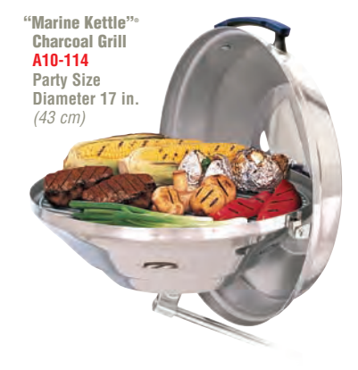
Mounts sold separately.