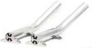
CAST 316 BASE TUBES