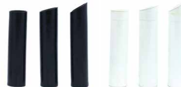
ALL 10-1/2" VINYL INSERTS ARE FOR 88520 AND 88530 SERIES ROD HOLDERS