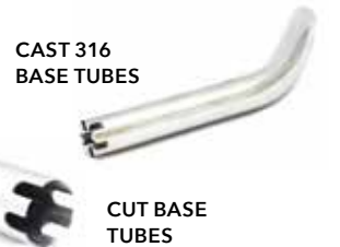
CUT BASE TUBES