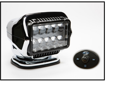
STRYKER I ED 30204 (White) 30214 (Black) 30264 (Chrome)

Package Includes: Hard Wired Joystick Dash Mount Remote Stainless Steel Mounting Bracket