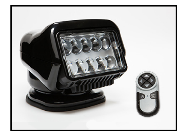
STRYKER I ED 30004 (White) 30514 (Black) 30064 (Chrome)

Package Includes: Wireless Handheld Remote Stainless Steel Mounting Bracket