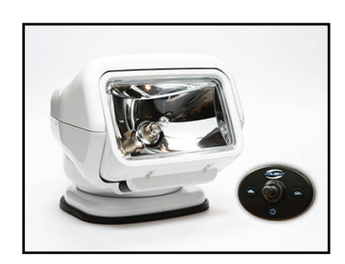
STRYKER HALOGEN 3020 (White) 3021 (Black) 3026 (Chrome)

Package Includes: Hard Wired Joystick Dash Mount Remote 20' Wiring Harness, Rockguard Stainless Steel Mounting Bracket