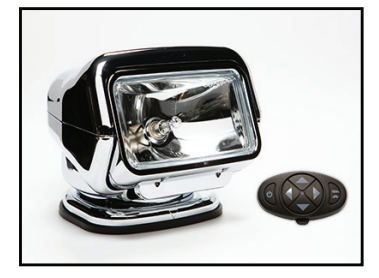
STRYKER HALOGEN 3100 (White) 3151 (Black) 3106 (Chrome)

Package Includes: Wireless Handheld Remote Stainless Steel Mounting Bracket Rockguard