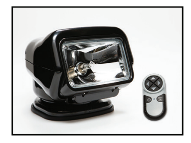
STRYKER HALOGEN 30002 (White) 30512 (Black) 30062 (Chrome)

Package Includes: Hard Wired Joystick Dash Mount Remote 20' Wiring Harness, Rockguard Stainless Steel Mounting Bracket