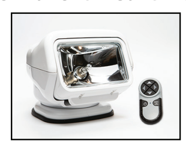
STRYKER HALOGEN 3000 (White) 3051 (Black) 3006 (Chrome)

Package Includes: Wireless Handheld Remote Stainless Steel Mounting Bracket Rockguard