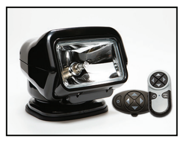
STRYKER HALOGEN 3067 (White) 3049 (Black) 3066 (Chrome)

Package Includes: Wireless Dash Mount Remote Stainless Steel Mounting Bracket Rockguard