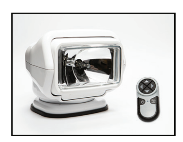
STRYKER HID 30001 (White) 30511 (Black) 30061 (Chrome)

Package Includes: Wireless Handheld Remote Stainless Steel Mounting Bracket