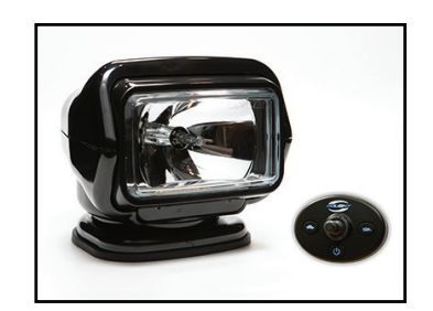
STRYKER HID 30201 (White) 30211 (Black) 30261 (Chrome)

Package Includes: Wireless Handheld Remote Stainless Steel Mounting Bracket