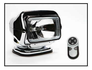
STRYKER HID 30003 (White) 30513 (Black) 30063 (Chrome)

Package Includes: Wireless Handheld Remote Attached magnetic Base 15' Power Cord with Cigarette Plug