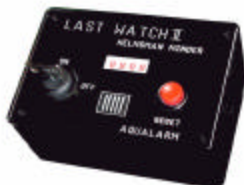
4-1/2" x 3" x 2"