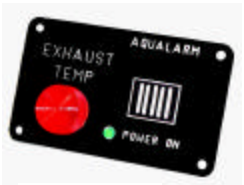
3" x 1-3/4"