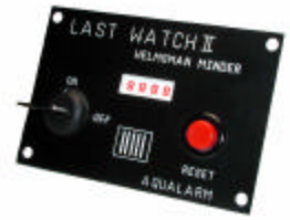
4-1/2" x 3"