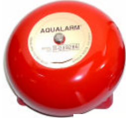
6" diameter on 4-1/2" base