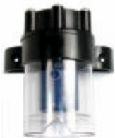
1-3/4" diameter x 3" high