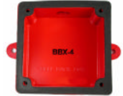
Water proof back box for bell 20140 Bell Back Box