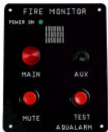
3-3/4" x 4-3/4"