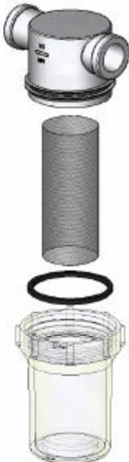
Exploded View—Parts Kits Not Available

Catalog: MS-030-140 / MS-03083 Warranty: 1 Year Limited SB-1041 / SB-1050